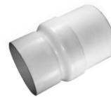
Part No. PVC 107 Concentric Reducer Bushing (SPG x H)